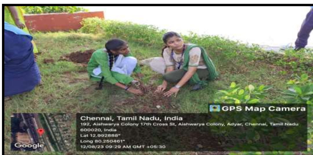
Students planting saplings