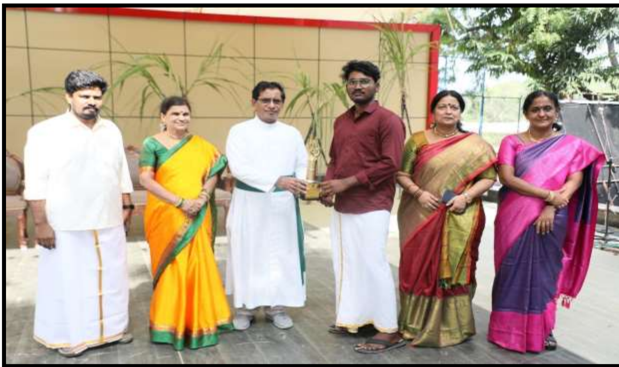
Department of Accountancy and Finance (Shift 2)