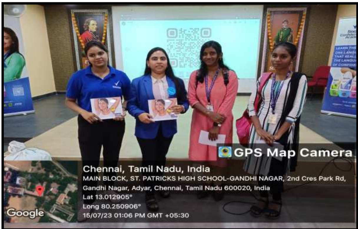
Trainers with Participants