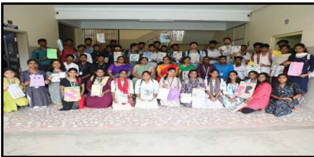
Participants with Paper Bag