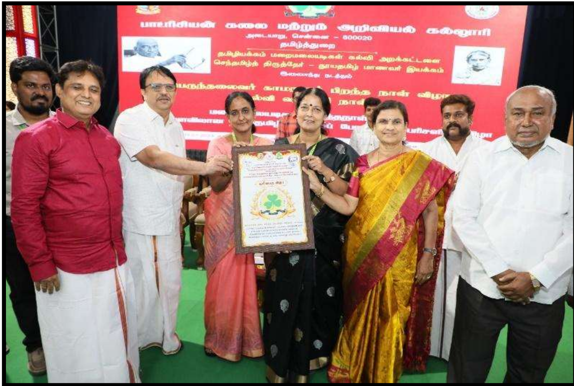
Certificate of Appreciation presented by the special guests to the college administration