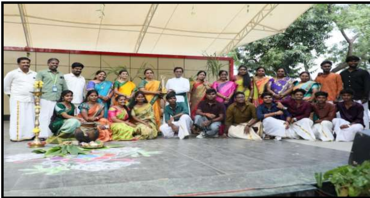
The Department of Commerce (Shift 1) receiving the first prize