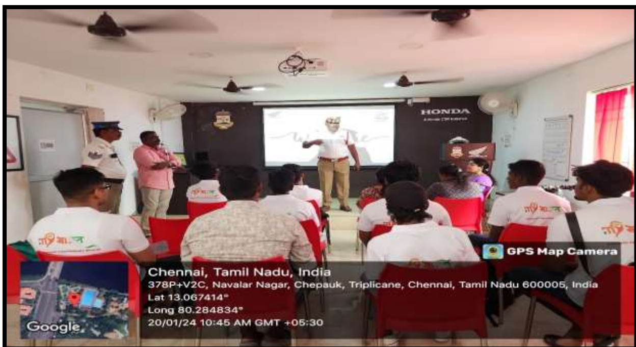
Training on Road Safety