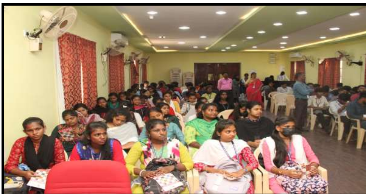
Active participation by Budding Entrepreneurs