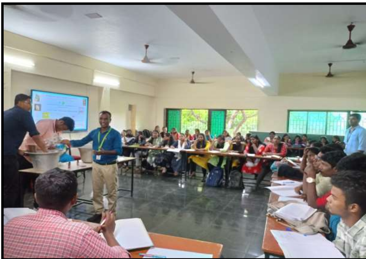
Training on making washing Powder