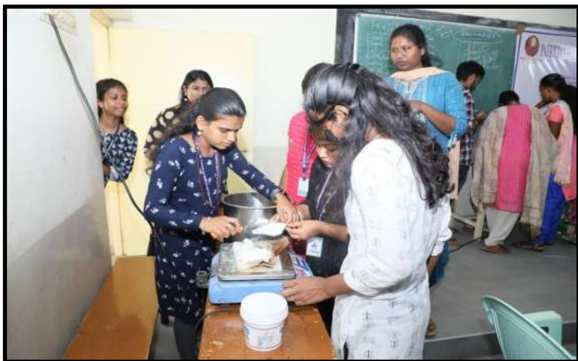
Cake Crème Making