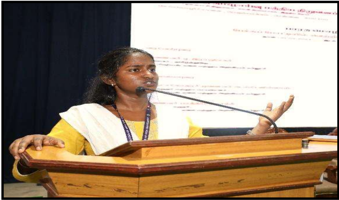
The prize-winning student delivered a speech at the prize distribution ceremony