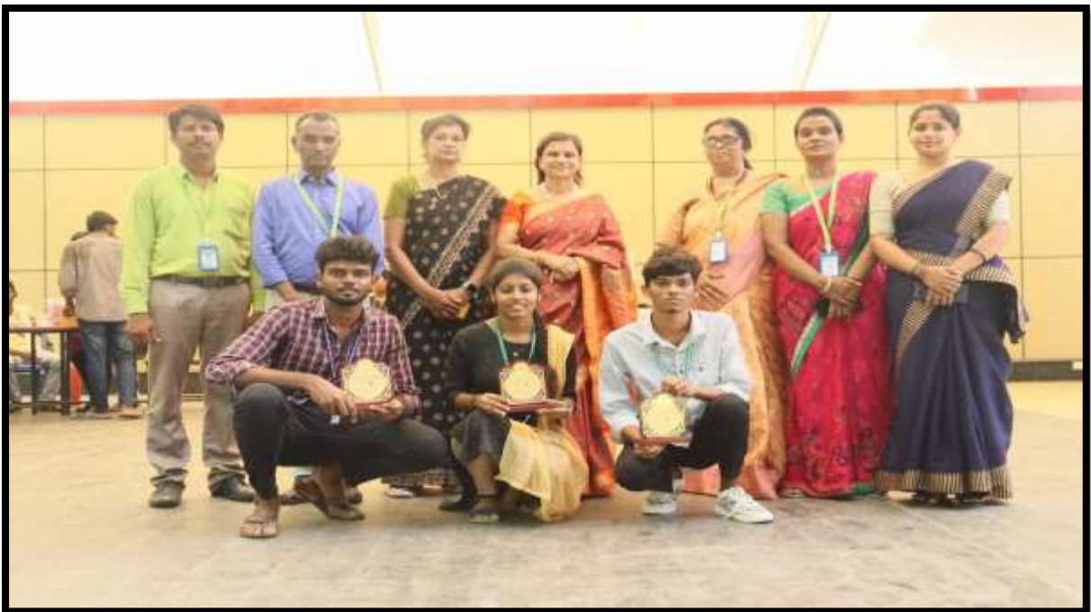
Prize Winners in Patrician Mela