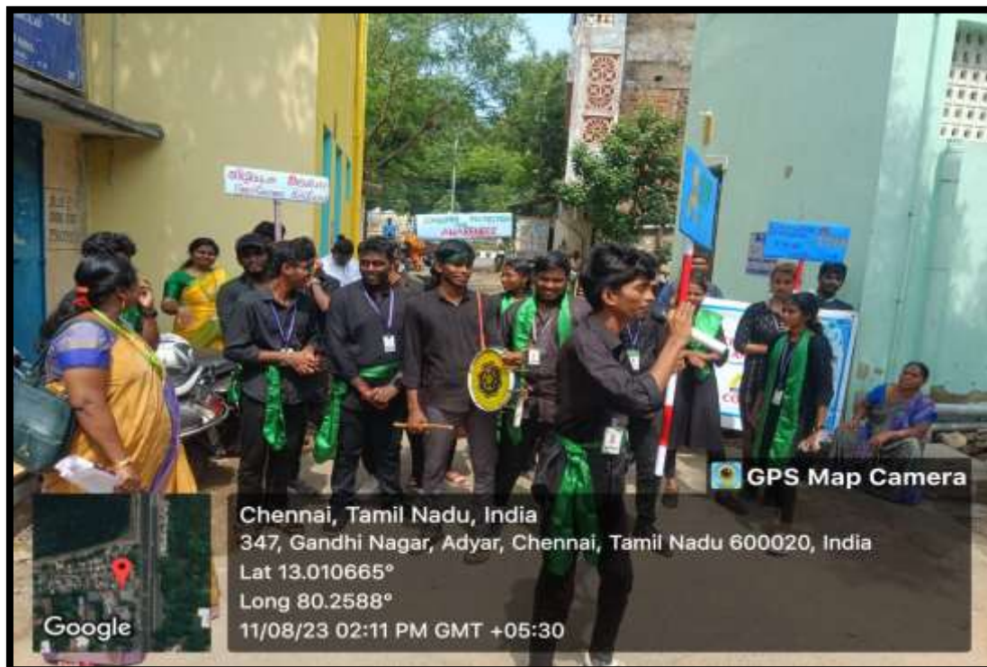
A Consumer Awareness Act