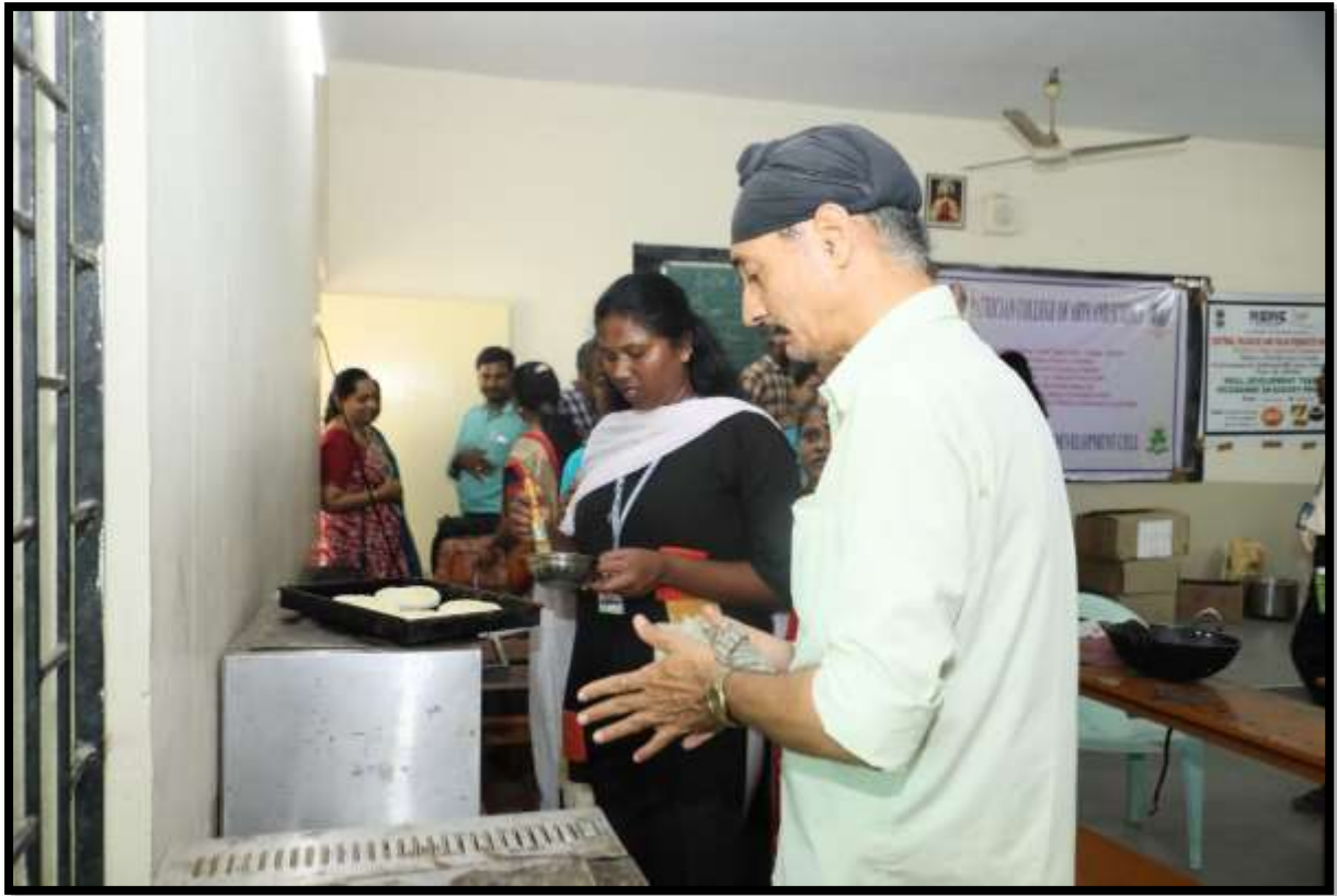
Participants with Chef