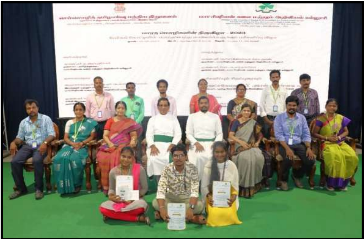
The prize-winning students with the special guests.