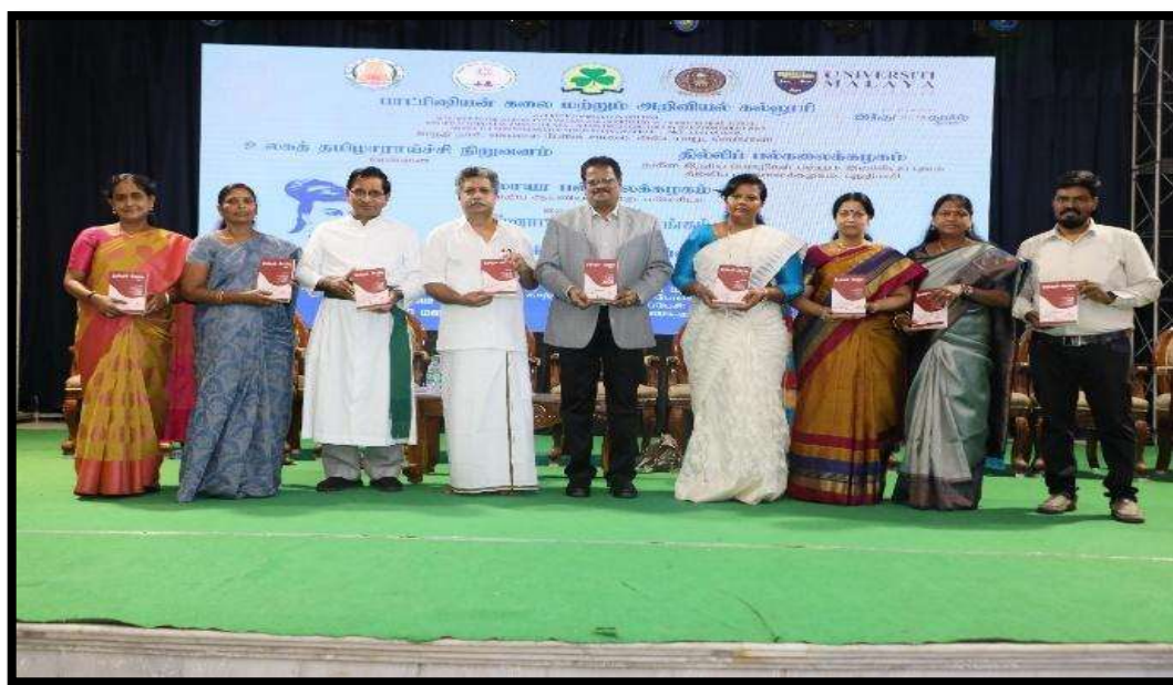
Release of the conference proceedings