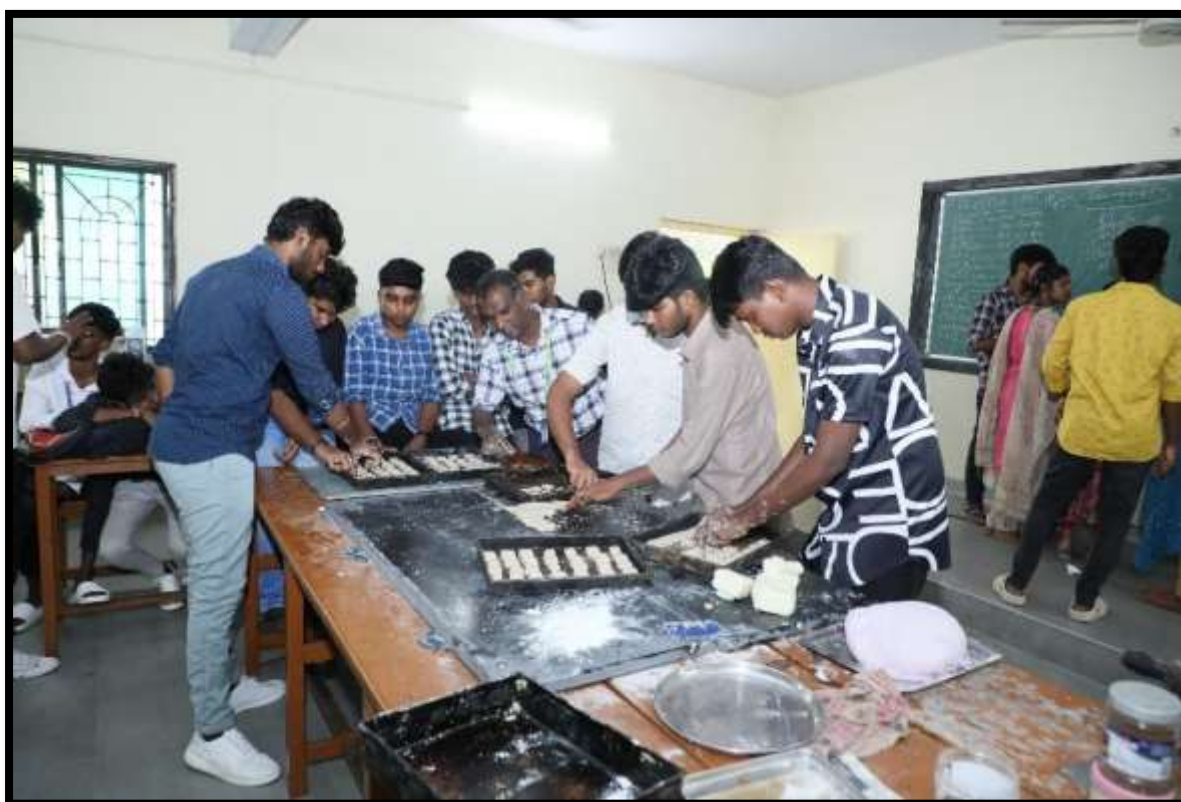
Butter Biscuits Making