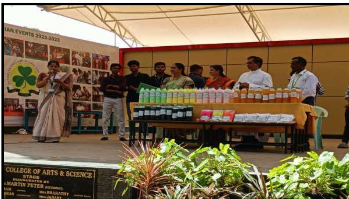
Exhibition of Products made during the Vocational Program