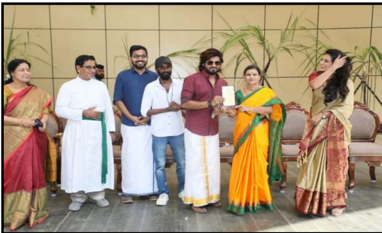
Presenting mementos to the special guests