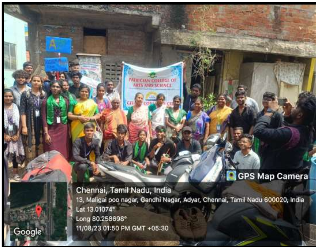
Students, Staff &amp; Public