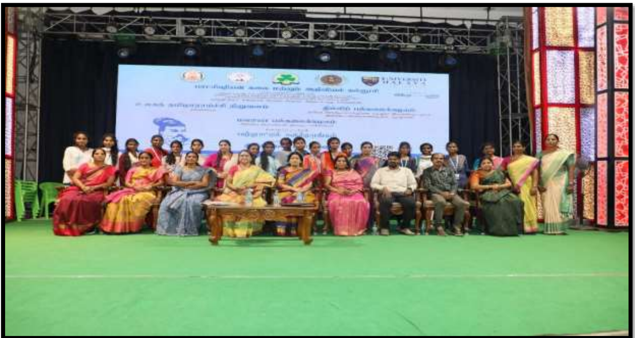
Tamil literature students who participated in the conference from various colleges