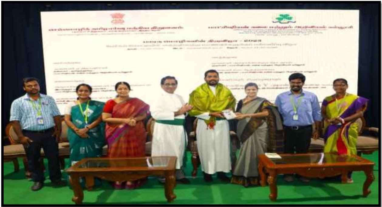
Honouring the special guests